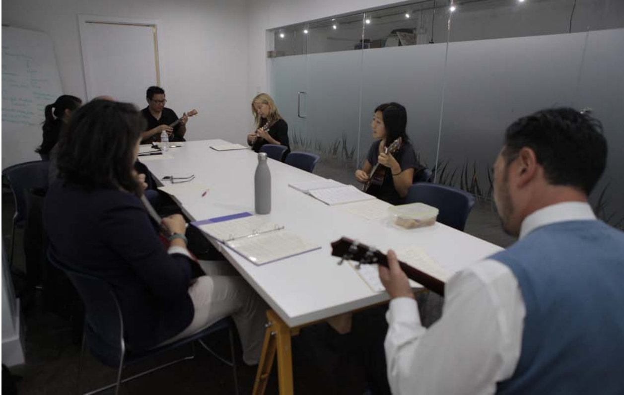
First Floor Meeting Room Seats 10-12