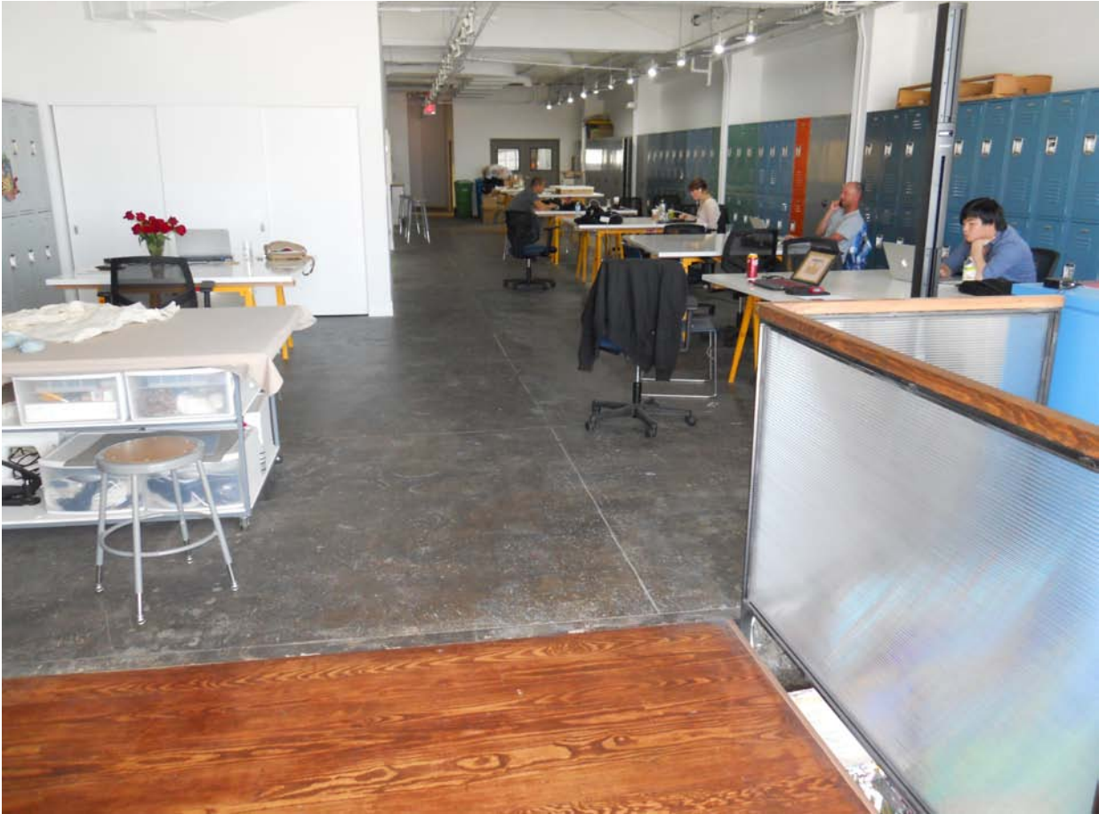
First Floor Shared Space